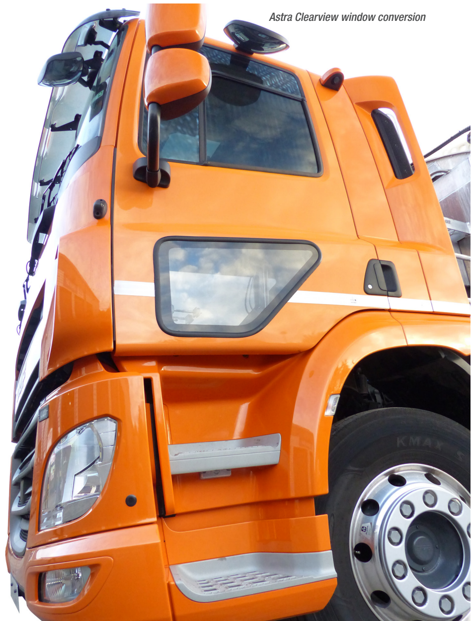
Astra Clearview window conversion

pedestrians. Importantly, the design, developed by Cheshire-based Astra Vehicle Technologies, allows the main passenger door window to open; a key benefit that enables drivers to have a clear view of traffic during poor weather and to allow access to the mirrors from the passenger seat for cleaning purposes.