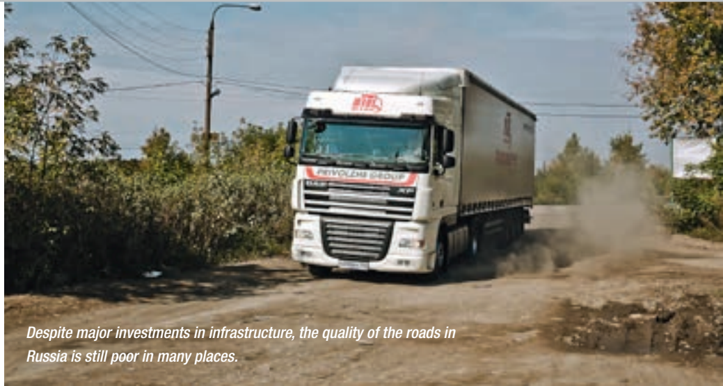
Despite major investments in infrastructure, the quality of the roads in Russia is still poor in many places.