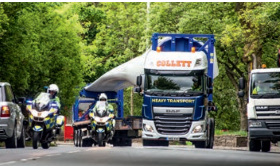
In Rochdale a five-strong police motorcycle escort team took us through the town.