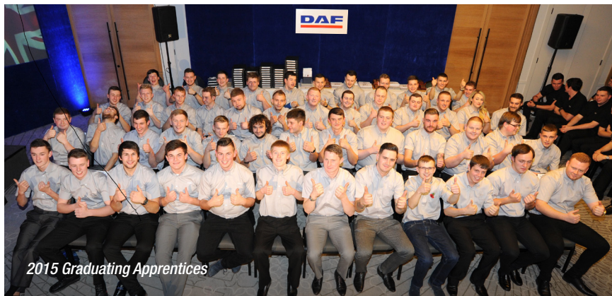
2015 Graduating Apprentices

October saw DAF Trucks celebrate the 20th Anniversary of its DAF Apprentice Programme. Regarded by many in the industry as the benchmark commercial vehicle training scheme for young people, the Programme culminates in an annual Apprentice of the Year Awards and Graduation Ceremony – this year at Tortworth Court Hotel near Bristol.