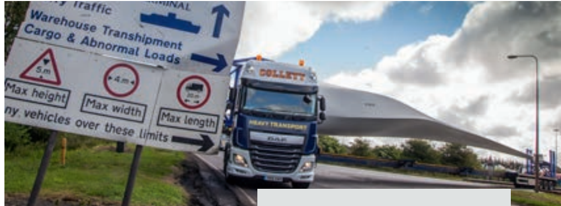
Left: After an hour loading, we departed the docks