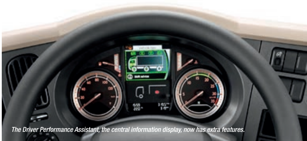
The Driver Performance Assistant, the central information display, now has extra features.

The many innovations mean that the DAF LF 2016 edition represents a major step in further enhancing truck efficiency, in line with the philosophy of DAF Transport Efficiency. Naturally the key features of DAF's distribution truck are still maintained, including the high load capacity thanks to the low kerb weight, easy manoeuvrability thanks to the smallest turning circle in its class and the high comfort and easy handling so valued by drivers. ■