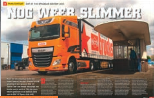
TRUCKSTAR, THE NETHERLANDS