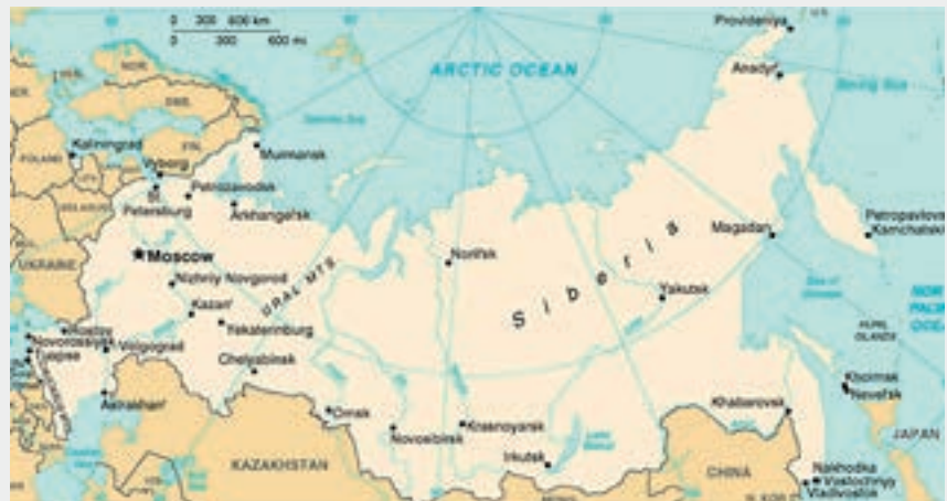
Russia is the largest country on Earth and has a surface area of 17,098,246 km 2 . It is almost twice as large as the second largest country, Canada. On 1 January 2015 Russia had 146,270,330 inhabitants according to the Russian authorities.