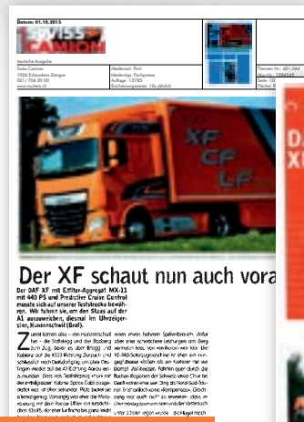
SWISS CAMION, SWITZERLAND