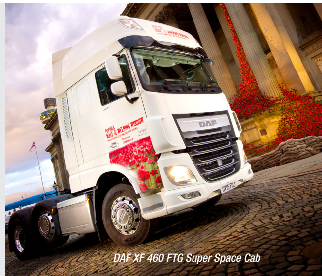
DAF XF 460 FTG Super Space Cab

DAF Trucks is sponsoring the transport of the art installations between venues and is supplying the trucks for all the moves. This Euro-6 DAF XF 460 FTG (pictured) was used to transport the ‘Weeping Window’ artwork from Woodburn Museum in Northumberland down to Liverpool.