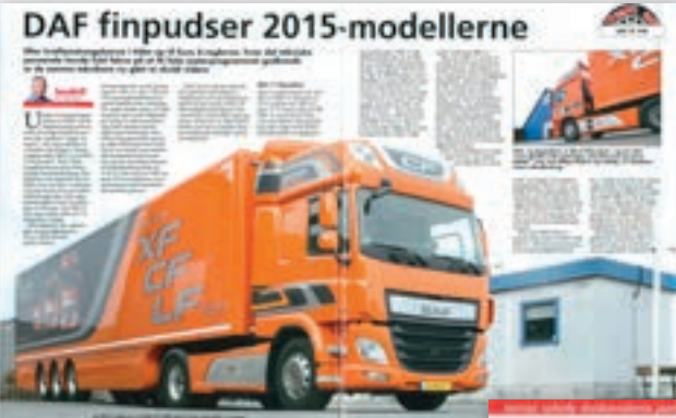
LASTBIL MAGASIN, DENMARK

KFZ-ANZEIGER 18-2015, GERMANY: "DAF trucks have excellent performance and are ideal for a fleet. The GPS-aided Predictive Cruise Control with Predictive Shifting, EcoRoll and the engine brake work very well. During the test the truck used little fuel and drove predictably and smoothly."